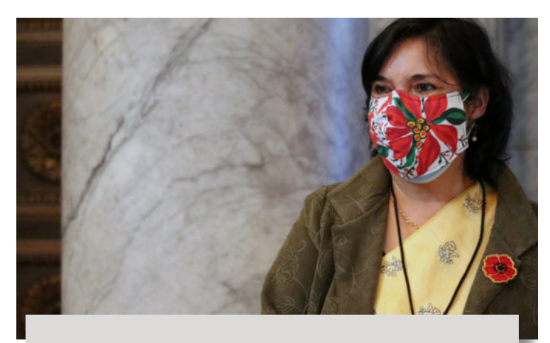
A Note From The Chair

This Endorsement Guide has been put together by a new, diverse endorsement committee. All registered candidates had the opportunity to be interviewed by the endorsement committee. Candidates not selected by the committee had a chance to be nominated from the floor by any 45th member. To make it into this guide, two-thirds of membership had to agree by a vote.