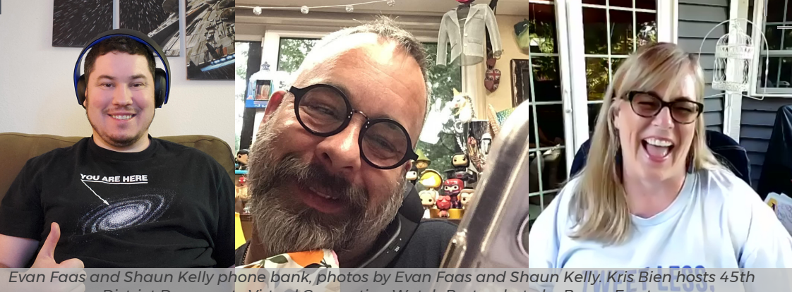
District Democrats Virtual Convention Watch Party, photo by Becca Everts.